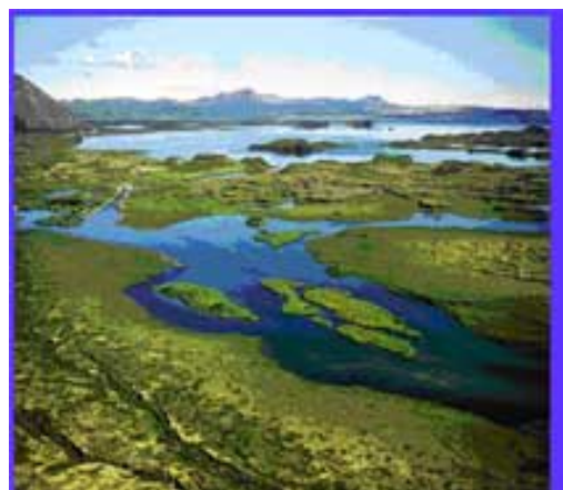
Sensitive uplands with low critical loads